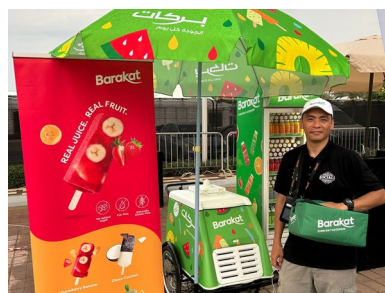
Events & Catering